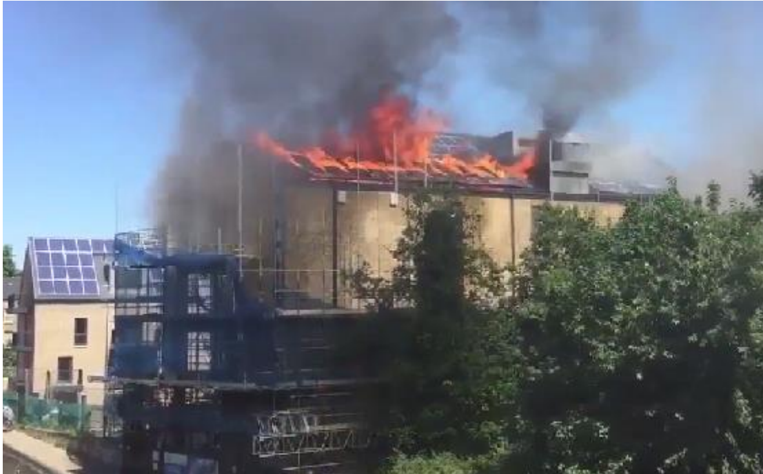
Figure 2 - Fire in Bow Wharf. Source: Stoker, 2017 [7].

In Germany, an analysis was published in 2015 by TÜV Rheinland Energie und Umwelt GmbH, which analyzes interventions in 2013. From the beginning of the installations until January 2013, approximately 1.3 million photovoltaic systems with a total output of over 30 GW were installed in Germany. 430 cases of fires in photovoltaic systems were analyzed, of which 85 fires were caused by incorrect installation or product defect [2]. An example is the hall fire in Walldorf in 2014 (Figure 3). The photovoltaic panels ignited together with the plastic roofing. Incorrect installation and improper selection of the roofing led to a fire.