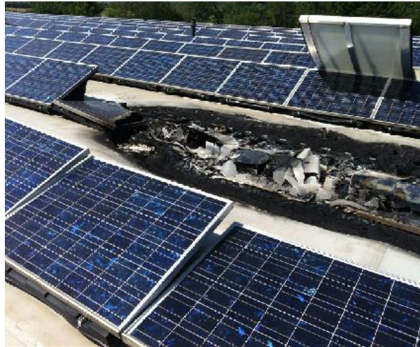
Figure 3 - Fire on the roof of the hall in Walldorf.